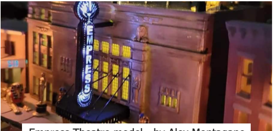
Empress Theatre model - by Alex Montagano

For many years one of the hottest topics across NDG was what to do with the Empress Theatre following the fire which tore through the inside of the building. While many groups have tried, no one has succeeded to date. In 2021, the city called out to the community to submit ideas for rebuilding. You can see the different proposals here: <u>Transformation of the Empress</u>.