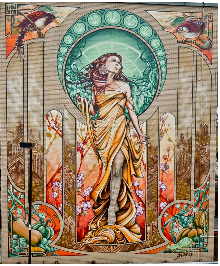
Our Lady of Grace Mural by 'A' Shop